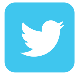
3745 Twitter Followers Up 245 Followers in 2019