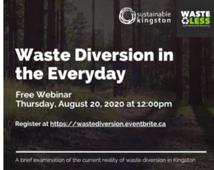
August - Waste Diversion with partner Waste-Less Junk Removal