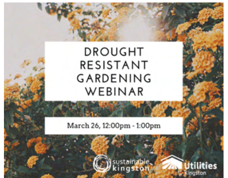
March - Drought Resistant Gardening with partner Utilities Kingston