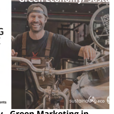
May - Green Marketing in the Age of COVID