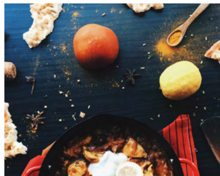
January - Sustainable Diets with partner KFL&A Public Health.

As part of the City of Kingston Climate Action Working Group recommendations, Sustainable Kingston was tasked with hosting a series of education webinars for the ICI sector and the community. All of the recommendation topics were covered with additional webinars added by Sustainable Kingston. In-person workshops were originally planned, but were quickly turned into webinars as staff navigated the pandemic.