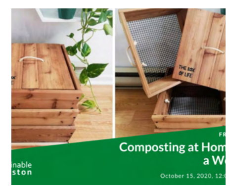
October - Worm Bin Composting with partner Box of Life