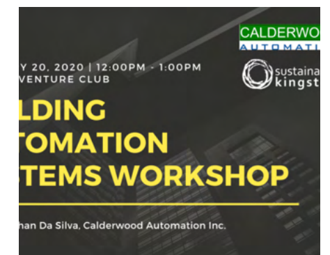
February - BAS Systems with partner Calderwood Automation