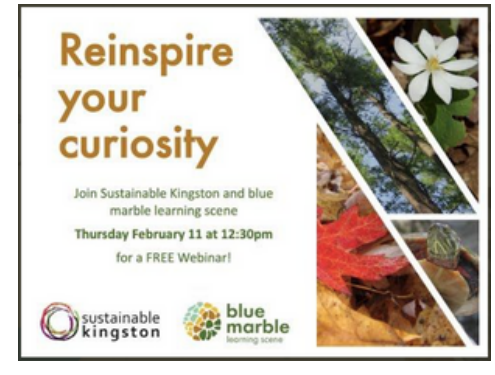
February - Nature and Education with partner Blue Marble Learning Scene

As part of the City of Kingston Climate Action Working Group recommendations, Sustainable Kingston was tasked with hosting a series of education webinars for the ICI sector and the community.